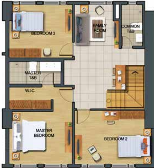
Garden Bi-Level (172–230 sqm)