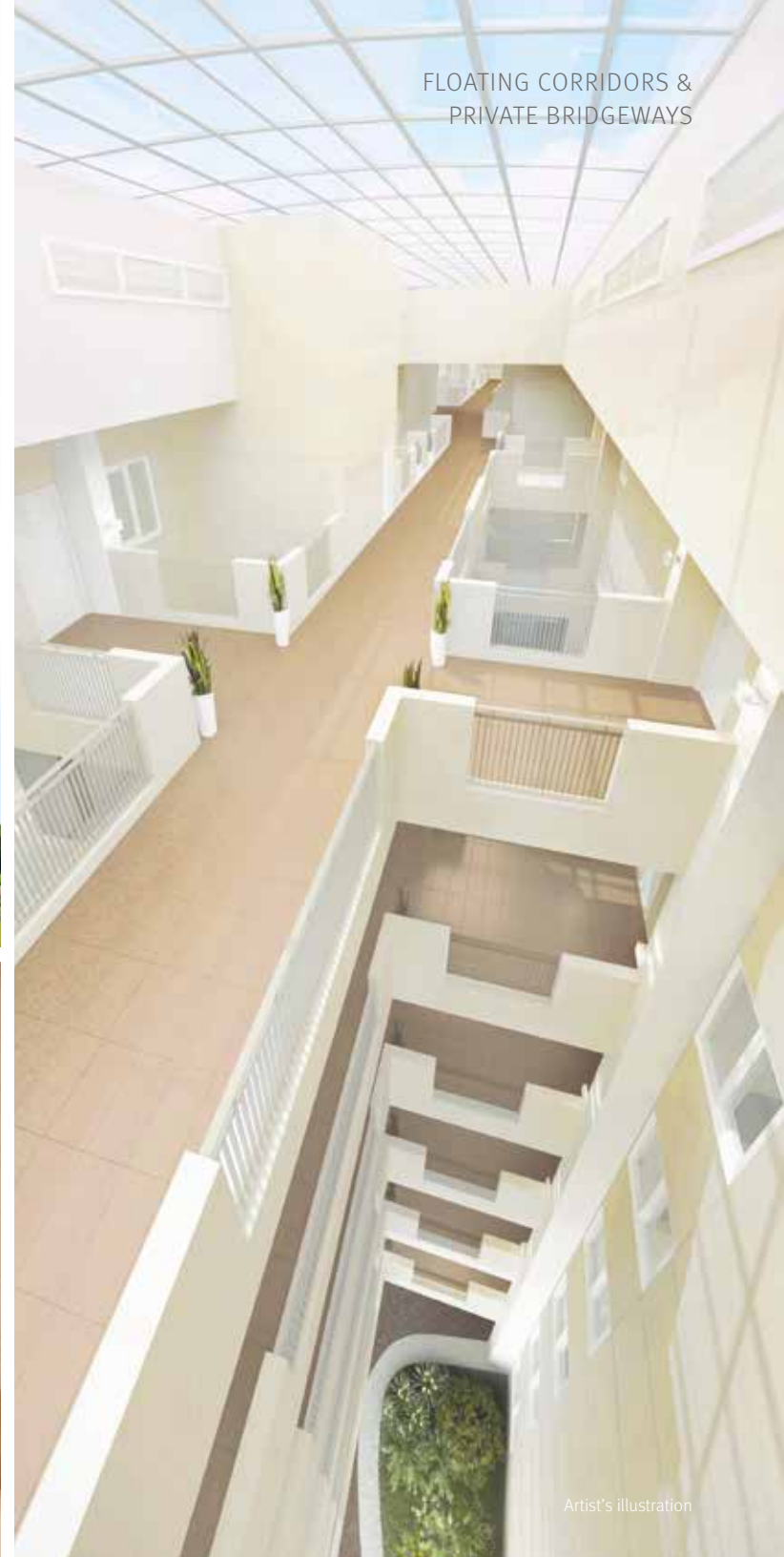
FLOATING CORRIDORS & PRIVATE BRIDGEWAYS