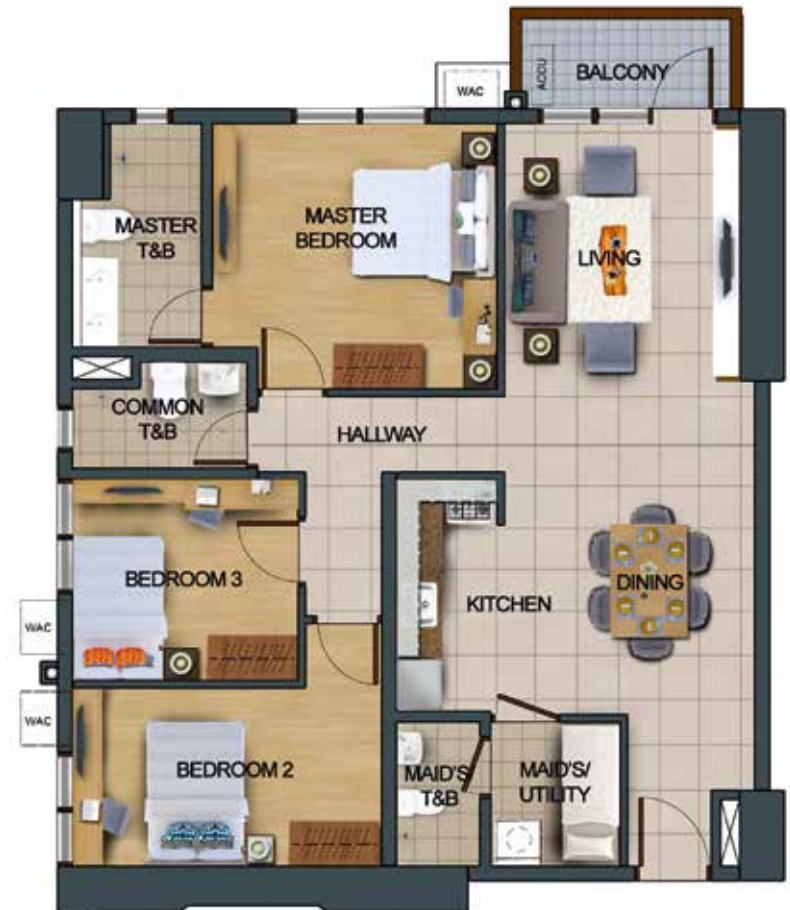
3-Bedroom Unit (98 sqm)