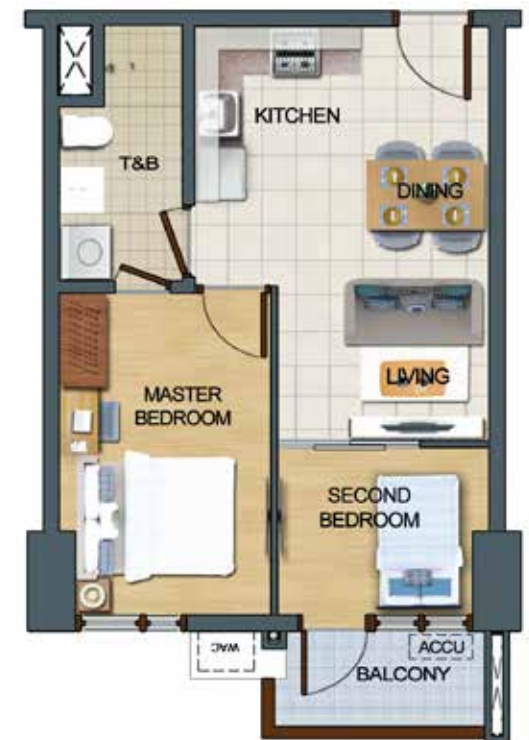
Junior 2-Bedroom (44-48 sqm)