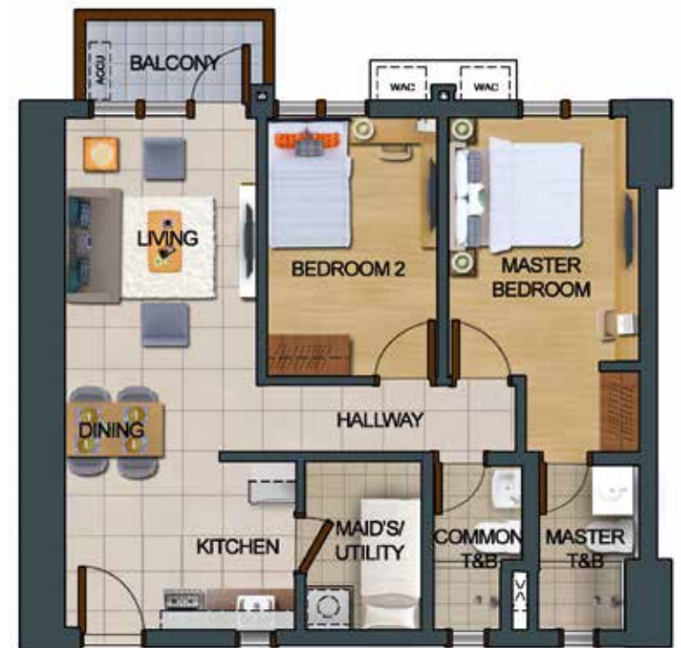
2-Bedroom Prime (70-73 sqm)